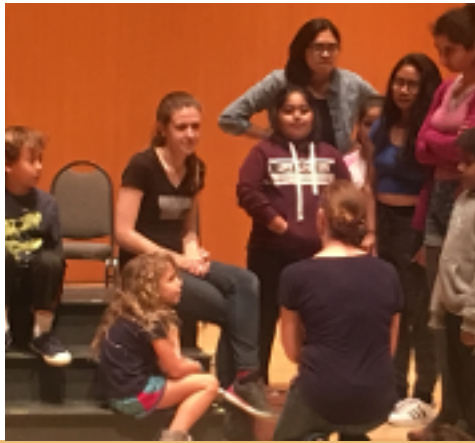
Rehearsal, Children's Opera, UCSC.