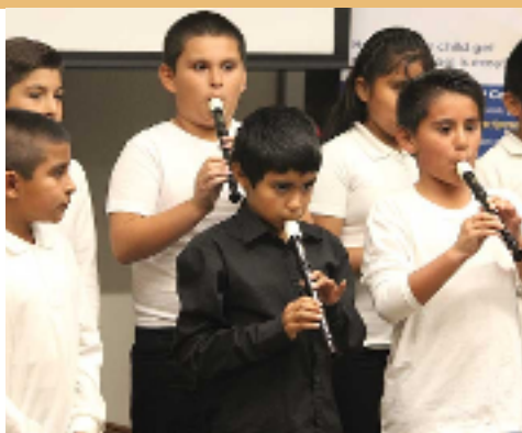
"Paso a Paso", Watsonville Library.